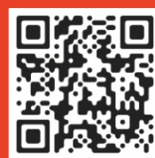
电子画册 (中文版) Chinese Catalogue

BeSure Technology Co., Ltd. Address: No.5 Yongye Road, Yundonghai Subdistrict, Sanshui District, Foshan, China Tel: +86-757-86635826 Mobile: +86 18823159072 Fax: +86-0757-86635848 E-mail: bst@mybesure.com